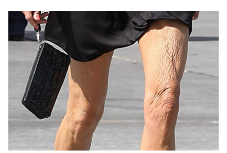
How to 'Fix' Crepey Skin