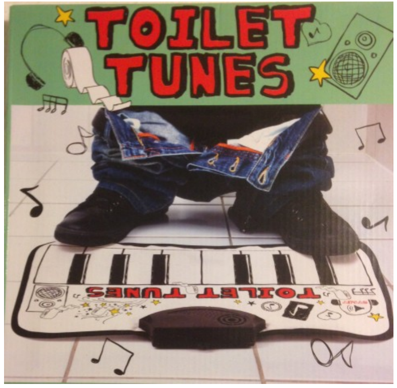
Create Symphonies Nos. 1 and 2 by tapping on the Toilet Tunes mat, this week's second prize.

into an online puzzle generator, but lots of other real words showed up as well. This week: Create a word or multi-word term that consists of adjacent letters — in any direction or several directions — in the grid above, and provide a humorous definition, as in the examples above. You may also give an especially clever definition for an existing term you find. And you may use the word in a sentence, if that makes your entry funnier. Even with this many possible words, there's a good chance that many people will send in the same word, and it'll come down to the description. (If you're having trouble printing out the grid above, print it from here.)