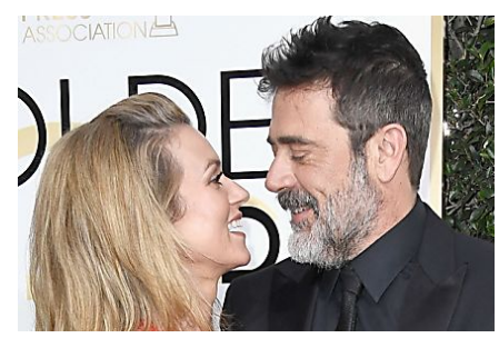
They Gave Everyone Else at the Golden Globes Serious Relationship Envy